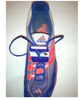
Put the shoe strings through the 4 holes in the chips and tie them back into the loops.